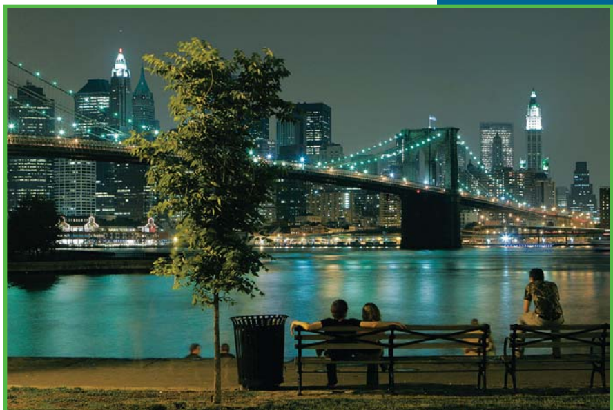
Etienné Frossard © 2005