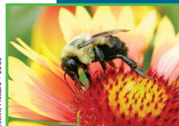
Etienne Frossard © 2005