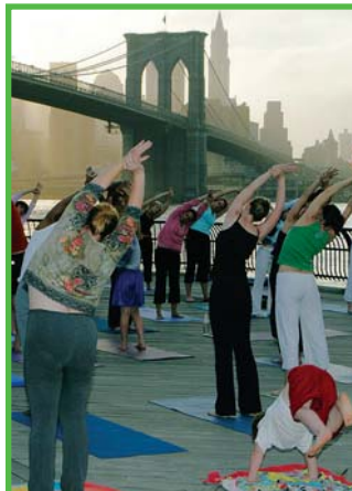
Etienné Frossard © 2005