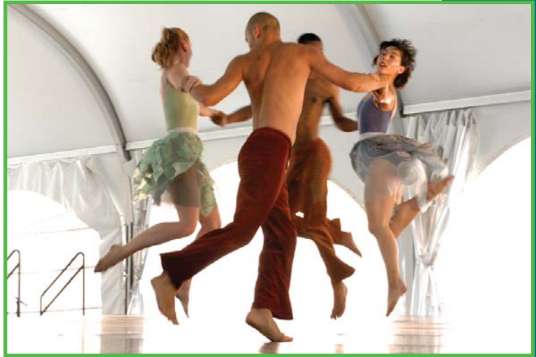
Julienne Schaer © 2005

DRUMS, DANCE & DRAMA, continues on page 3