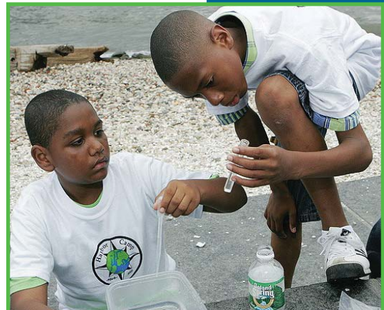
Clockwise from top: Battery Dance Company performs at the Tobacco Warehouse; Harbor Campers test the waters of the East River and learn about the estuary's ecology; a quiet evening in Brooklyn Bridge Park; Park visitors find inner peace on the boardwalk at Sunset Yoga, led by Noodle Yoga.